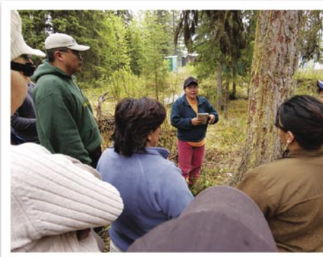
Aboriginal Health Sciences field trip near Nautley